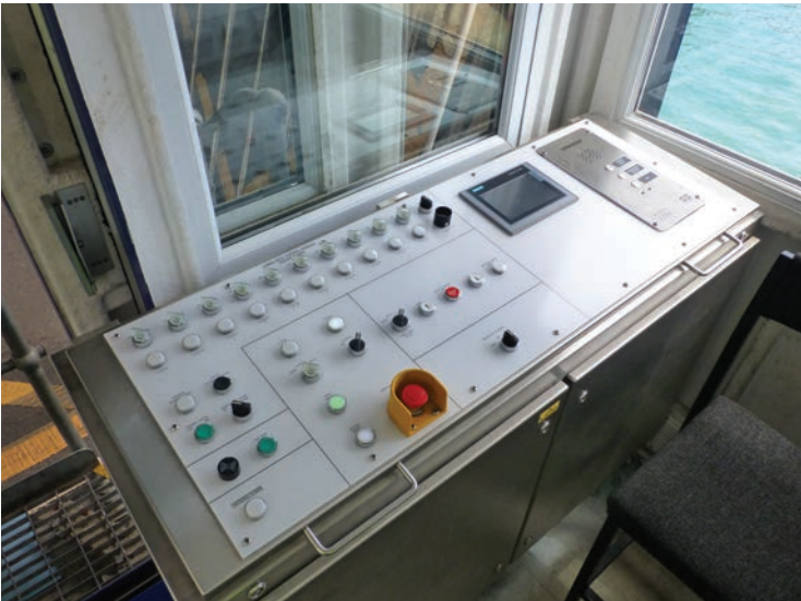
Peel Harbour swing bridge | Isle of Man