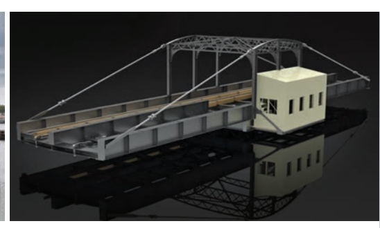
Refurbishment of railway swing bridges

Despite our range of experiences and skills, some clients choose to engage us for elements or modules of our expertise.